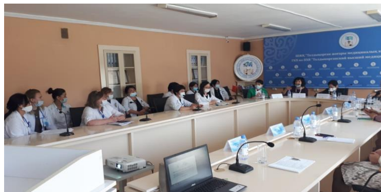
Photo 3. EEC conducts an interview with the chairperson of the CEP and the heads of the offices.

Members of the EEC visited the museum, college dormitory, first-aid post, sports and assembly halls. The information support department, consisting of three computer classes, was examined (181 computers connected to the Internet and 2 interactive panels are involved in the educational process).