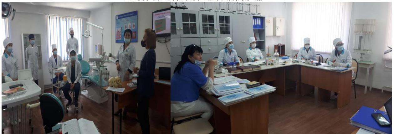
Photo 5. Interview with students